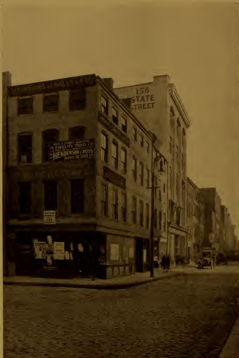
Site of the Crown Coffee House and Fidelity Trust Co. Building in 1916